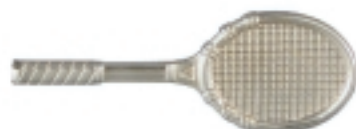
TC-30113 Tennis Racquet