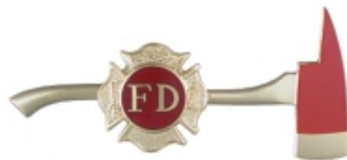
TCA-2380 with 2787 emblem