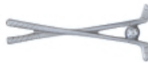
TC-41312 Golf Clubs and Ball