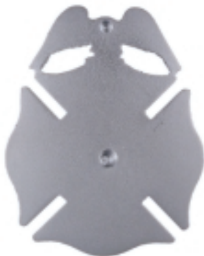
Screw Post Designed for use with cap