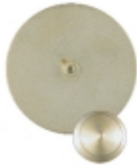
Heavy duty clutch-back A double locking clutch-back on a 5/16" fusion welded post.