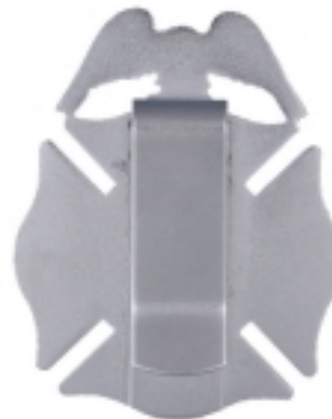
Large Wallet Clip