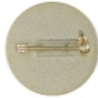
Safety Catch A "Safety Pin" attachment.