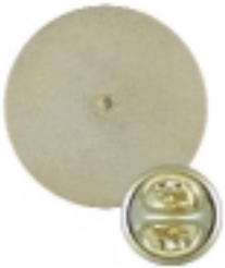
Clutch back A standard butterfly attachment on a fusion welded stainless steel post.