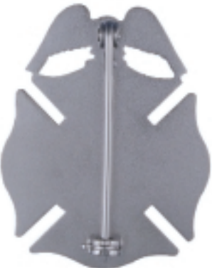
Safety Catch (standard) Breast badge attachment