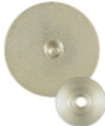
Screw post A threaded fusion welded bolt with locking nut.