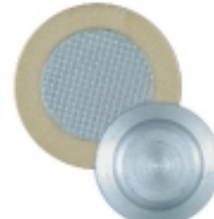
Magnetic Avoids damage to delicate fabrics while providing a secure hold.