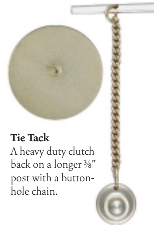
Tie Tack A heavy duty clutch back on a longer 3/8" post with a button-hole chain.