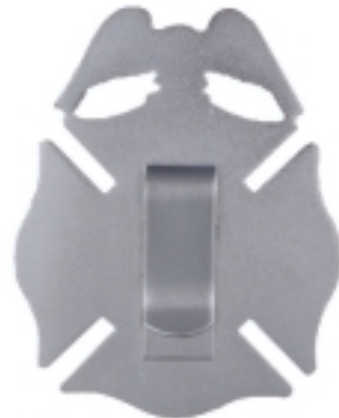
Small Wallet Clip