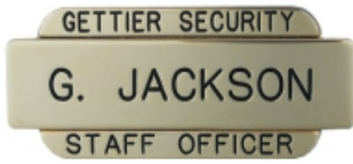
Two panel frame 10733 Accommodates 500 series