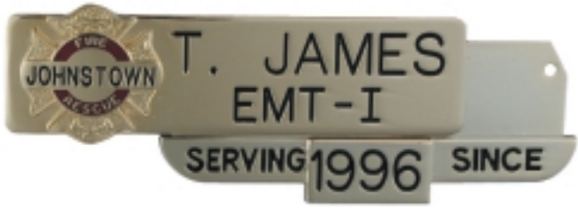
One panel frame Service Award 9340 accommodates 300 series 4862 accommodates 500 and 400 series 8020 accommodates 600 series

CHOOSE ANY EMBLEM OR SEAL IN THIS CATALOG TO COMPLIMENT YOUR NAME BAR. IF YOU DON'T SEE WHAT YOU WANT, CALL US, WE PROBABLY HAVE IT.