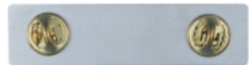
Clutch posts 1/4" (no extra charge)