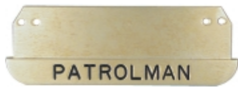
One panel frame 10458 Accommodates 500 and 600 series