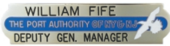
Die struck/epoxied logo

Please specify that your name plate will have a frame attached so that we may make it with longer 3/16" pins for easy attachment.