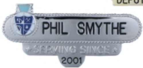
Die struck/enamelled logo