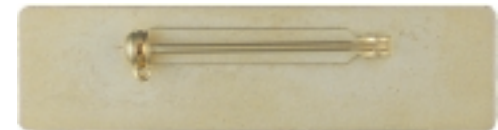
Safety catch (no extra charge)