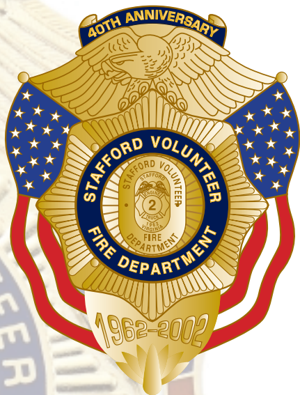
Full color art

For over 75 years we've been designing and manufacturing the highest quality Badges, Name Bars and emblems available.